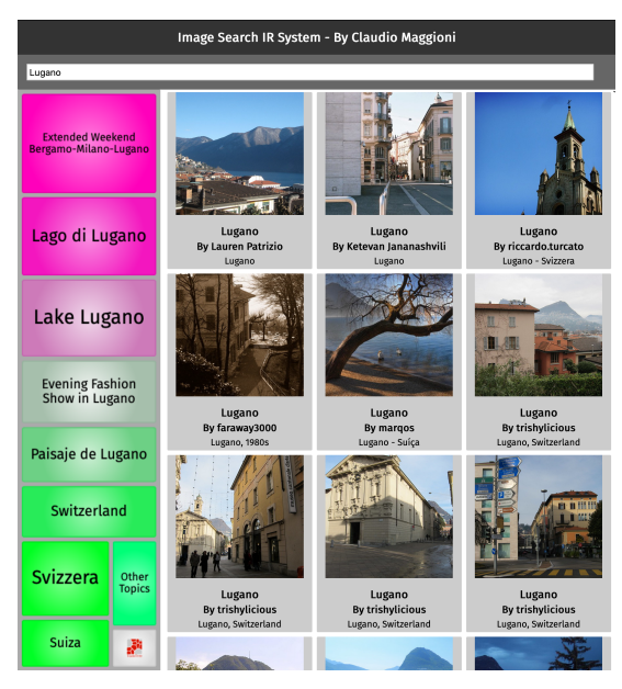
(b) After the user inputs a query and presses Enter, resulting images are shown on the right. Found clusters are shown on the left using FoamTree.

(a) The UI, when opened, prompts to insert a query in the input field and press Enter. Here the user typed "Lugano".