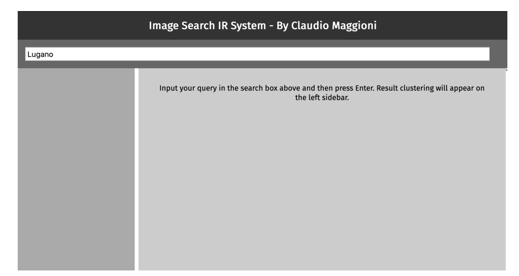
Figure 1 illustrates the IR system's UI showing its features.

(a) The UI, when opened, prompts to insert a query in the input field and press Enter. Here the user typed "Lugano".